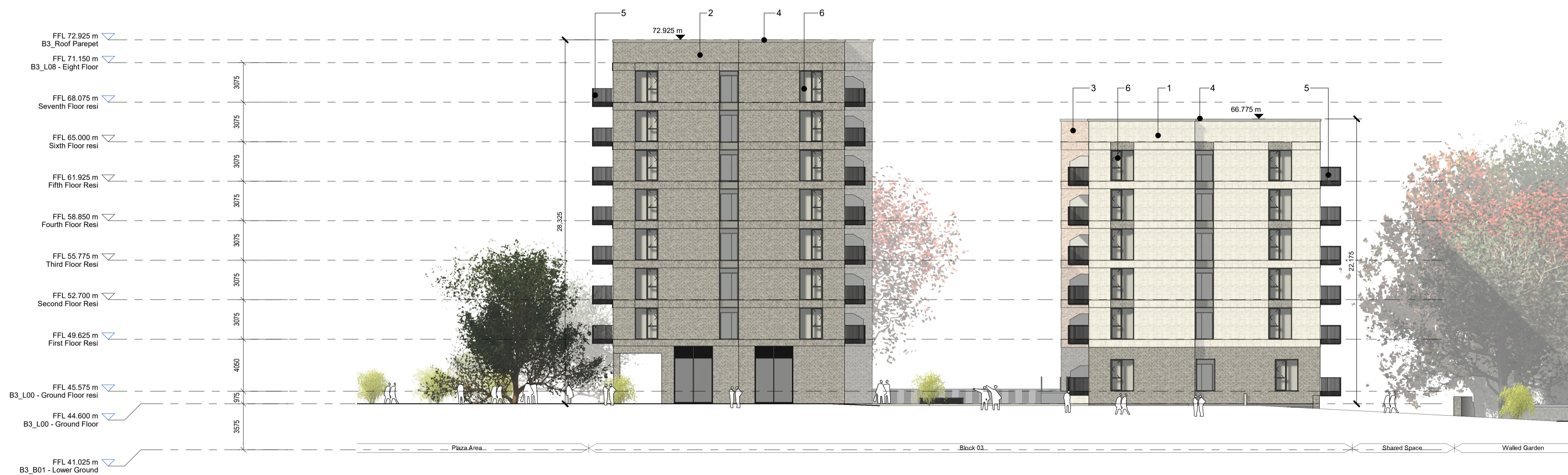
South Elevation 1 : 200