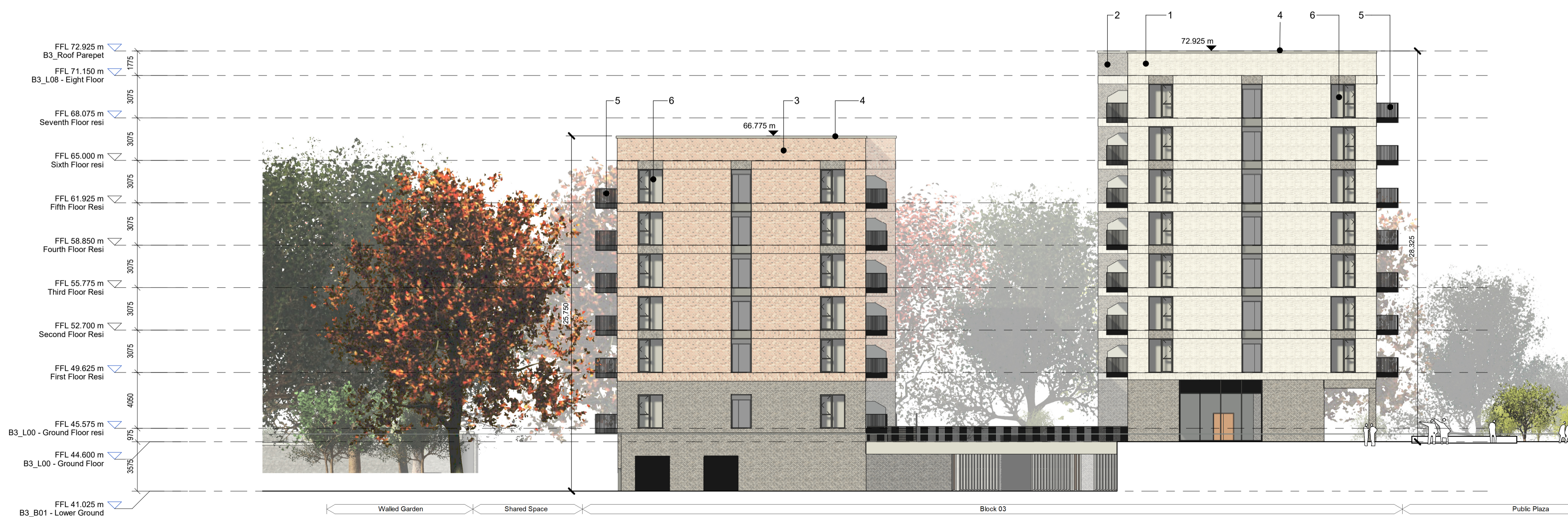
North Elevation 1 : 200

Notes: - Do not scale from this drawing. Use figured dimensions in all cases. - Verify dimensions on site and report any discrepancies to the Architect immediately. - This drawing is to be read in conjunction with the Architect's Specification. - © This drawing is copyright and may only be reproduced with the Architect's permission.